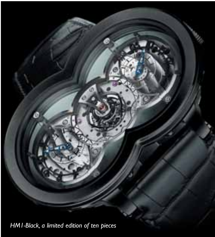
HM1-Black, a limited edition of ten pieces

HM1 was the Machine that broke the mold. To a world