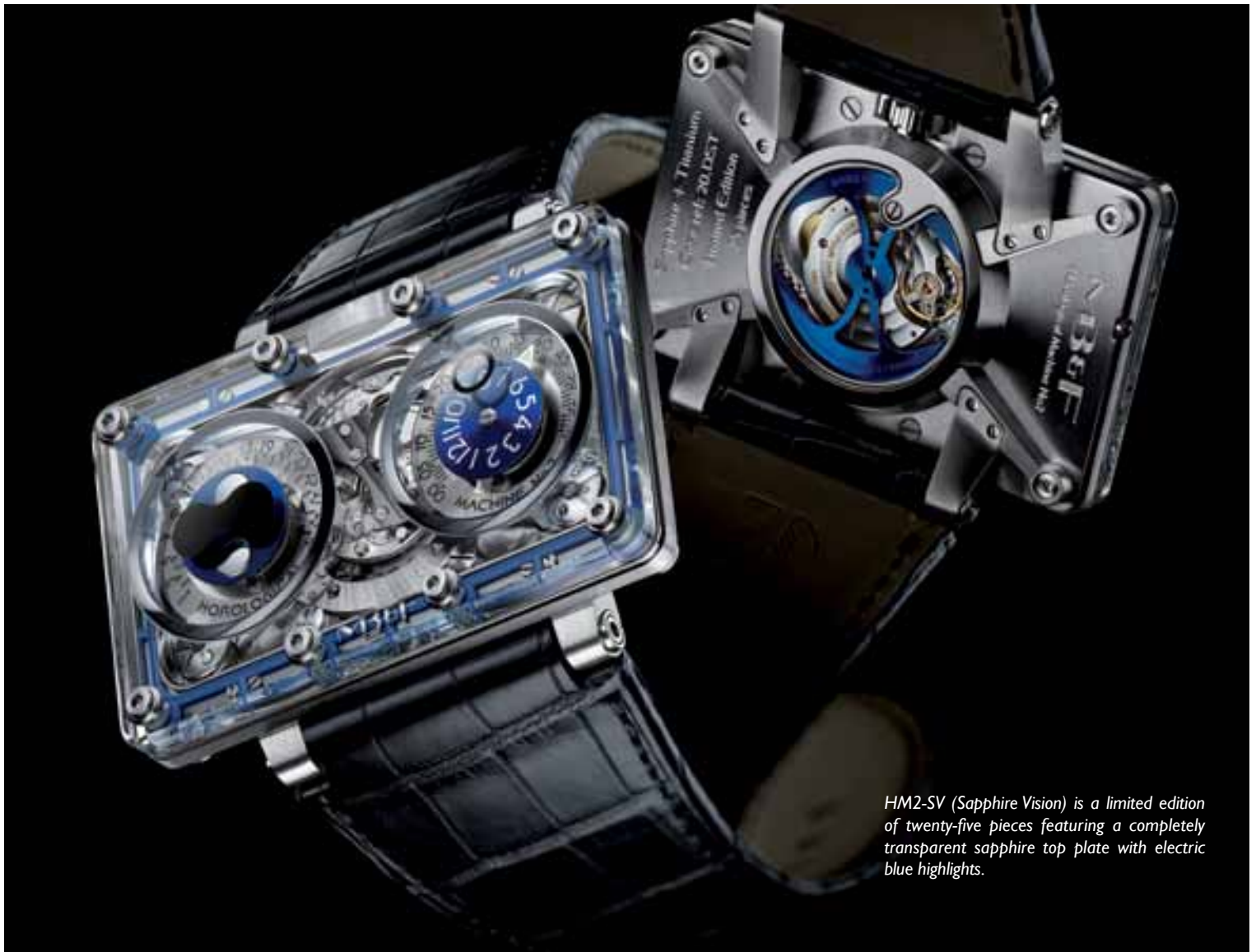
HM2-SV (Sapphire Vision) is a limited edition of twenty-five pieces featuring a completely transparent sapphire top plate with electric blue highlights.