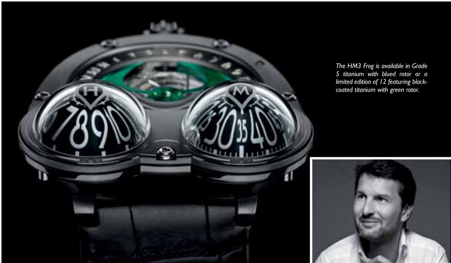
The HM3 Frog is available in Grade 5 titanium with blued rotor or a limited edition of 12 featuring black-coated titanium with green rotor.