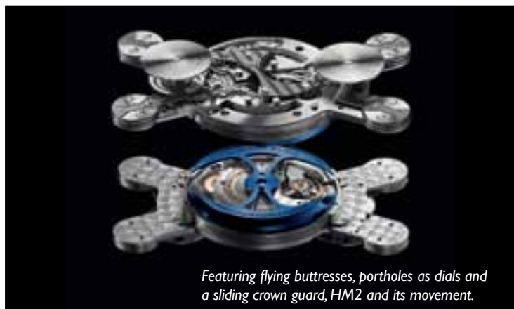
Featuring flying buttresses, portholes as dials and a sliding crown guard, HM2 and its movement.