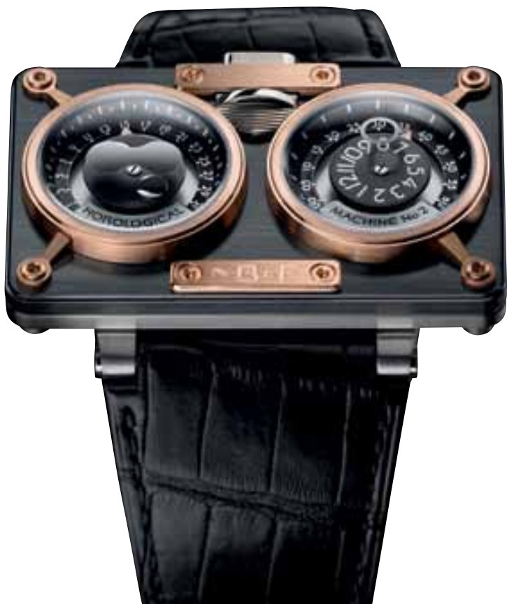
HM2 with ceramic top plate and red gold

Each of the two portholes on Horological Machine No.2 offers the viewer time in a different context. Conventional (if the word can ever be used in relation to MB&F) time is indicated in the right-hand porthole by jumping hours and concentric retrograde minutes, while a more laid-back approach to time is seen in the left porthole by means of a retrograde date and bi-hemisphere moon phase.