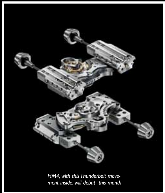
HM4, with this Thunderbolt movement inside, will debut this month