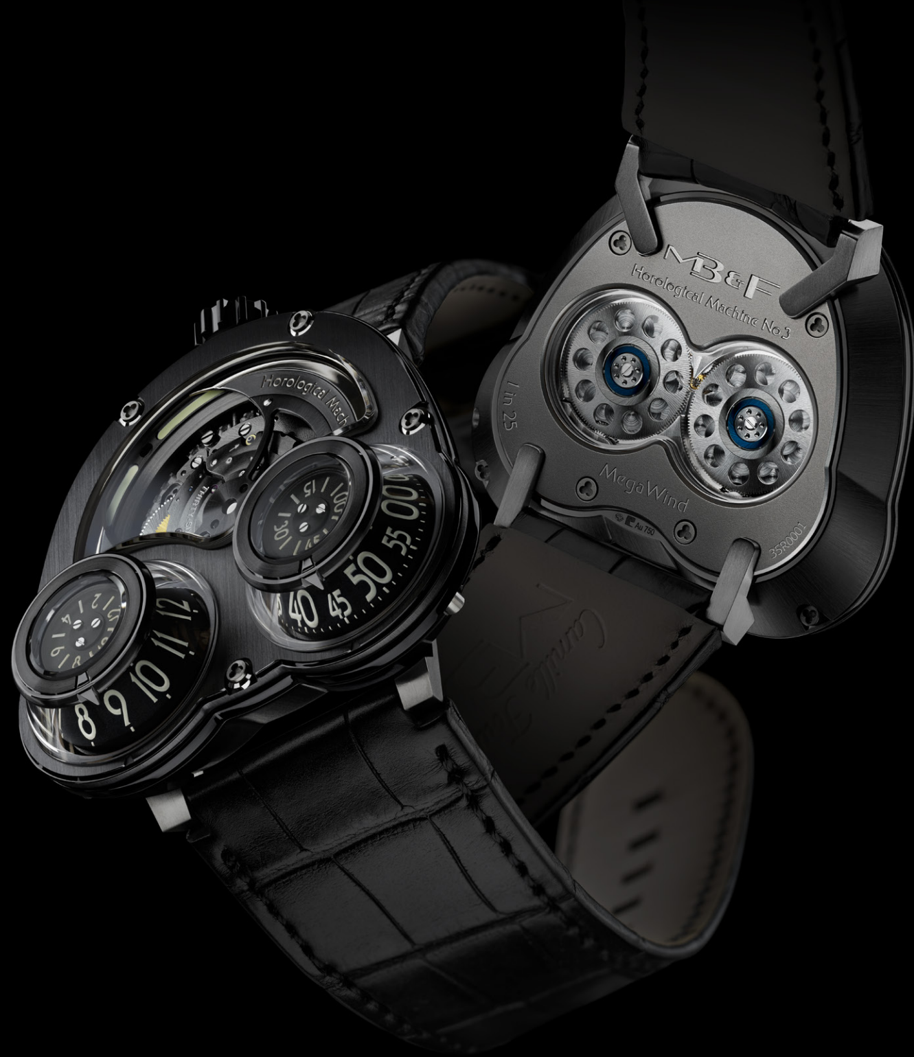
MB&F MEGAWIND FINAL EDITION LIMITED EDITION OF 25 PIECES