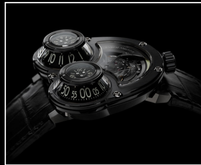
MEGAWIND FINAL EDITION PROFILE

FOR FURTHER INFORMATION PLEASE CONTACT: CHARRIS YADIGAROGLOU, MB&F SA, RUE VERDAINE II, CH-1204 GENEVA, SWITZERLAND EMAIL: CY@MBANDF.COM TEL: +41 22 508 10 33