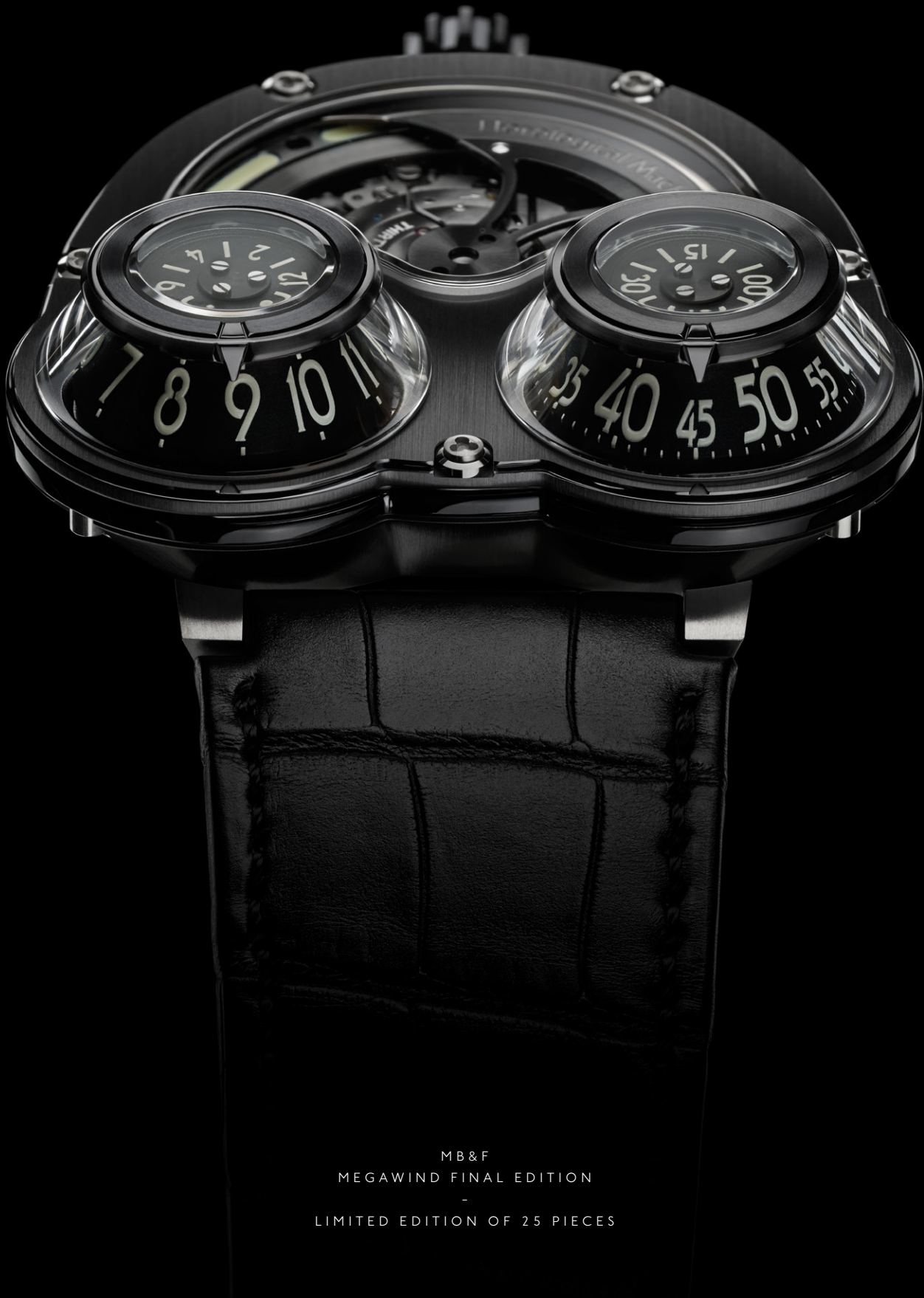
MB&F MEGAWIND FINAL EDITION LIMITED EDITION OF 25 PIECES