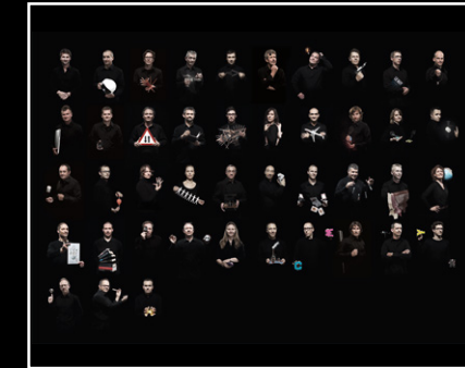
MEGAWIND FINAL EDITION FRIENDS LANDSCAPE