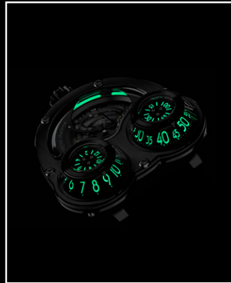
MEGAWIND FINAL EDITION SUPER LUMINOVA