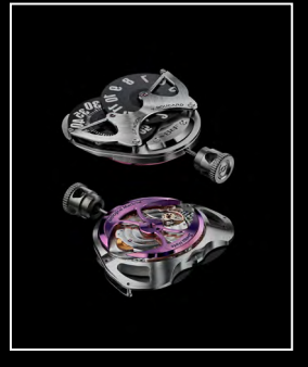
HM5 CM ENGINE