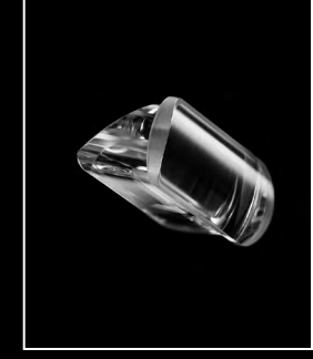
HM5 CM PRISM