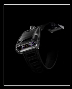
HM5 CM FRONT