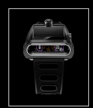
HM5 CM FACE