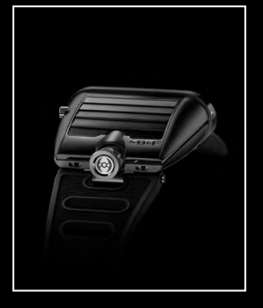
HM5 CM REAR