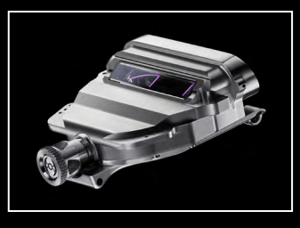
HM5 CM CONTAINER