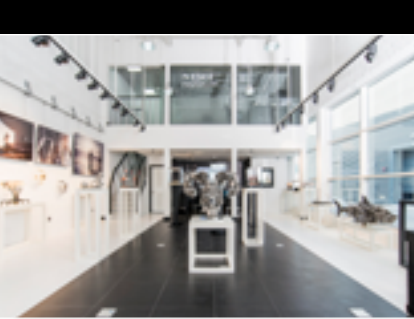
M.A.D. GALLERY DUBAI M.A.D. GALLERY DUBAI