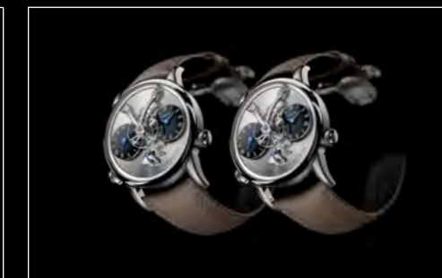
LM1 LONGHORN DUO