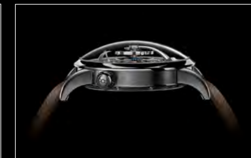
LM1 LONGHORN PROFILE 2