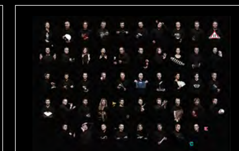
LM1 LONGHORN FRIENDS LANDSCAPE