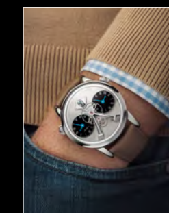
LM1 LONGHORN WRISTSHOT