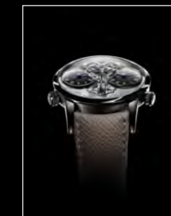
LM1 LONGHORN FACE