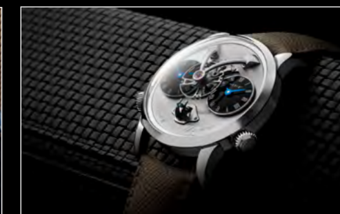
LM1 LONGHORN LIFESTYLE