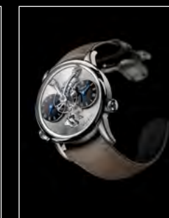
LM1 LONGHORN FRONT