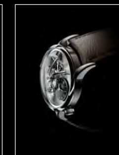
LM1 LONGHORN PROFILE