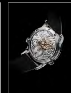
LM1 LONGHORN BACK