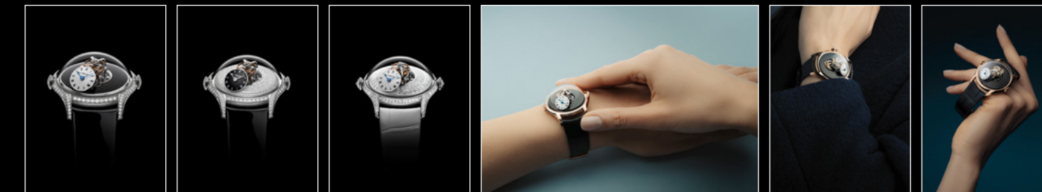
LM FlyingT LAQUE FACE LM FlyingT PAVE FACE LM FlyingT BAGUETTE FACE LM FlyingT WRISTSHOT LM FlyingT LIVE SHOT 1 LM FlyingT LIVE SHOT 2