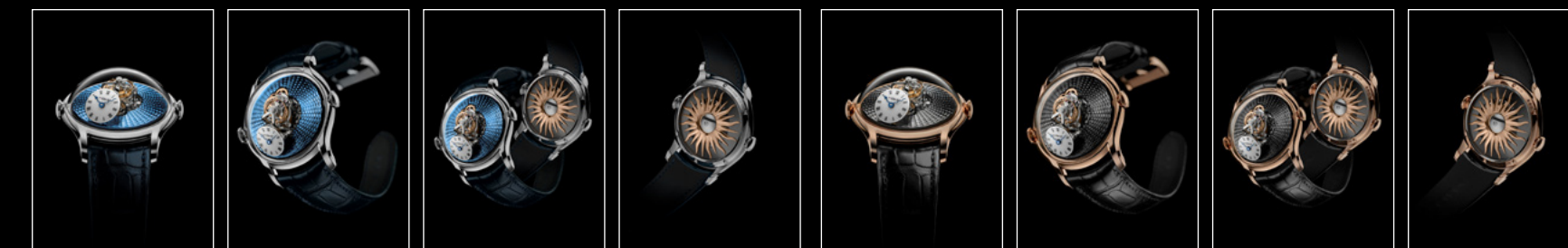
LM FlyingT PT FACE LM FlyingT PT FRONT LM FlyingT PT LM FlyingT PT BACK LM FlyingT RG FACE LM FlyingT RG FRONT LM FlyingT RG LM FlyingT RG BACK