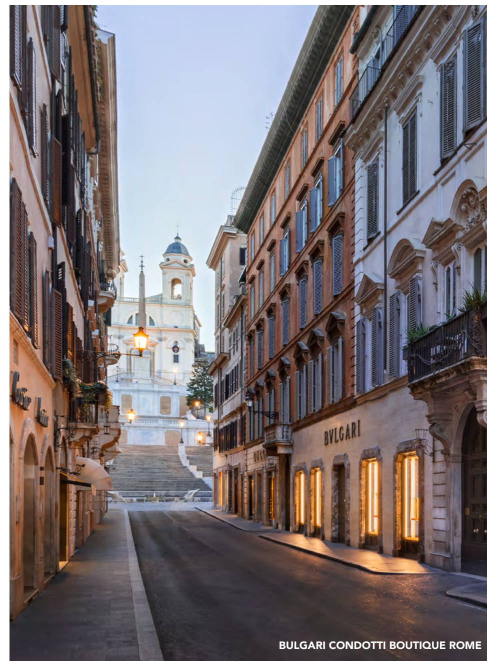
BULGARI CONDOTTI BOUTIQUE ROME

Demonstrated through its numerous philanthropic partnerships, Bulgari deeply believes in innovating the present for a sustainable future through its commitment to Corporate Social Responsibility and giving back – to nature and to the community