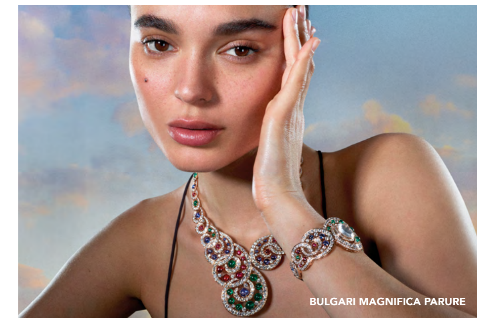
BULGARI MAGNIFICA PARURE