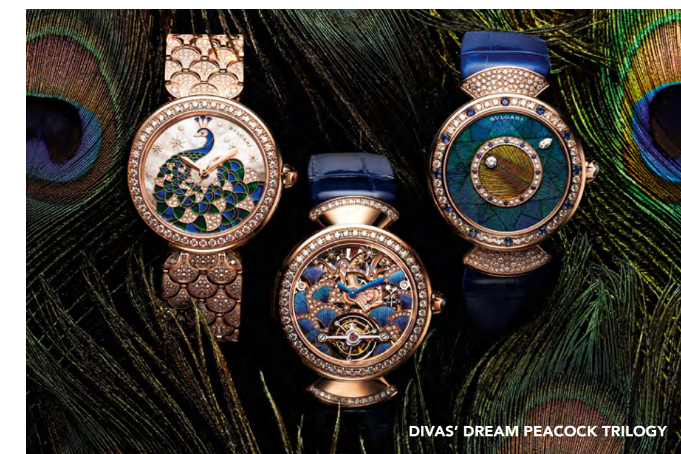
DIVAS' DREAM PEACOCK TRILOGY