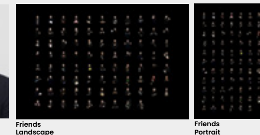
Friends Landscape Friends Portrait