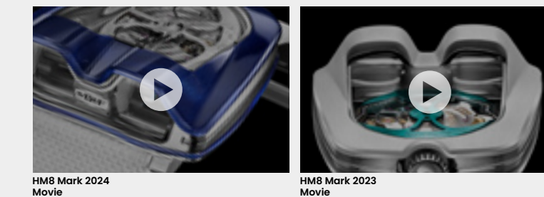
HM8 Mark 2024 Movie HM8 Mark 2023 Movie